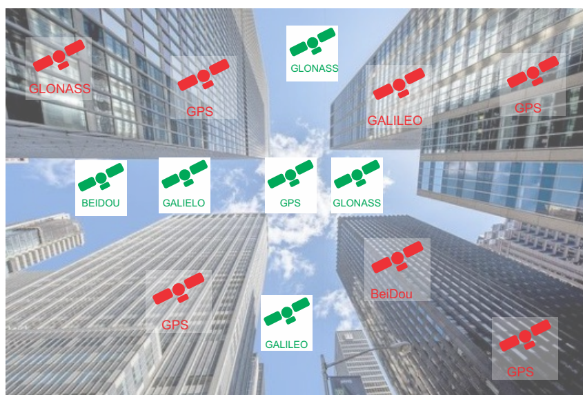
Figure 2: Multi-constellation - visible and masked satellites